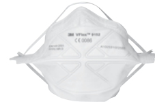
3M™ VFlex™ 9152 / 9152S Respirator